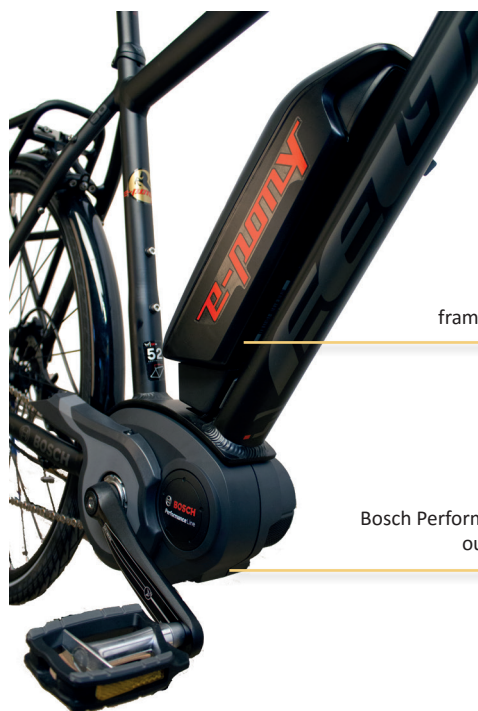
Bosch 500Wh frame type battery pack