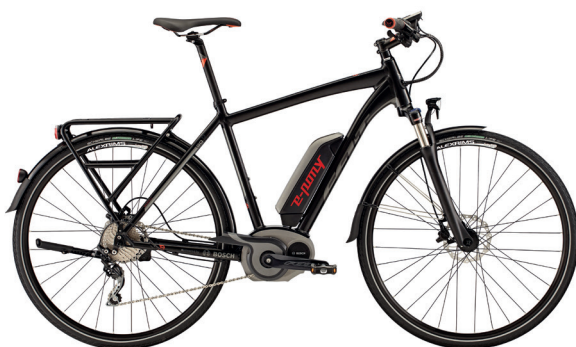
QX E-Pony Man